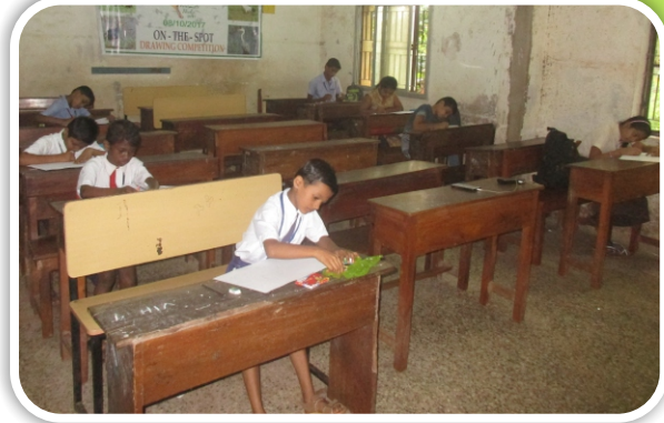
On The Spot Drawing Competition