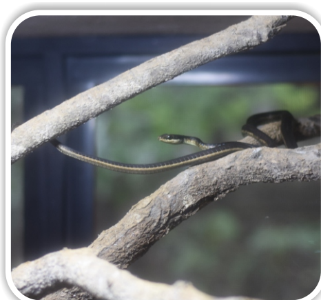
Common Bronzeback Tree Snake