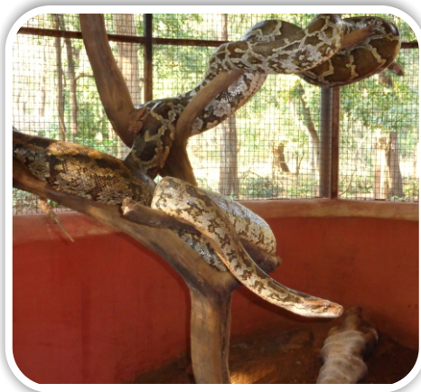
Indian Rock Python