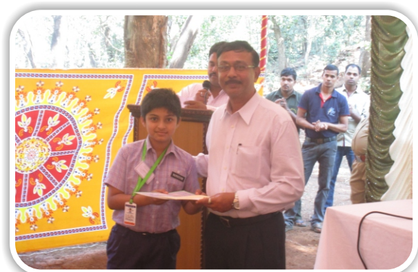
Prize Distribution by DCF/Zoo Director during Wildlife Week