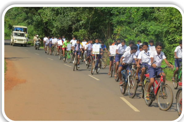
Cycle Rally (wildlife Week)