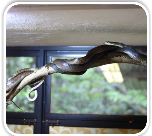
Indian Rat Snake