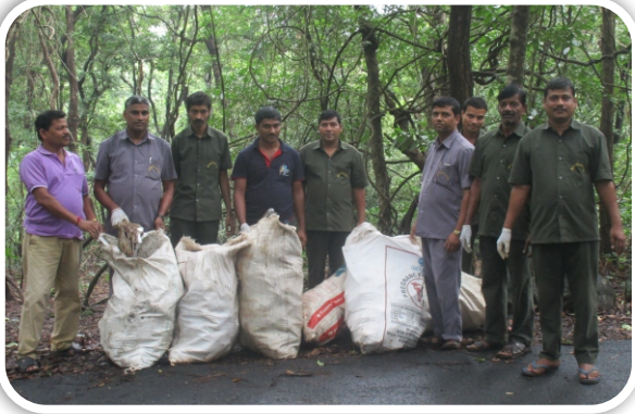
Cleanliness Drive On 2nd Oct