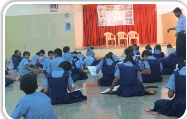
On The Spot Drawing Competition For Disabled Students