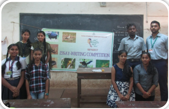
Essay Writing Competition