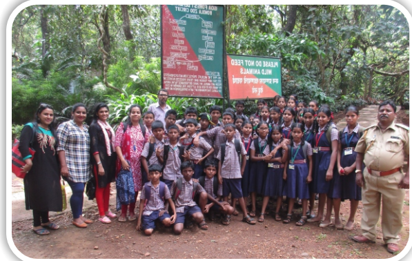
Nature Awareness Camp