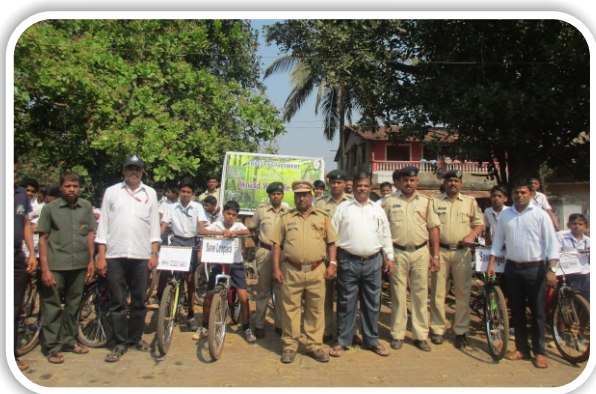
World Wildlife Day Cycle Rally