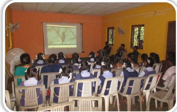
Screening Of Wildlife Documentary