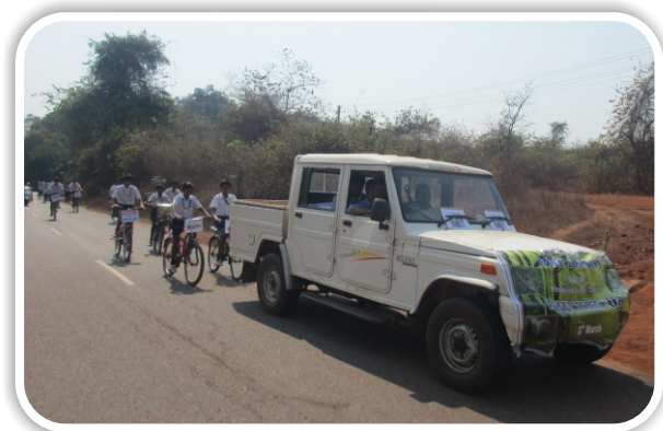
World Wildlife Day Cycle Rally