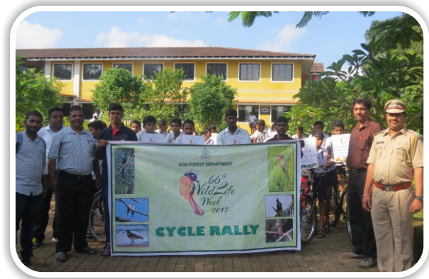
Cycle Rally (wildlife Week)