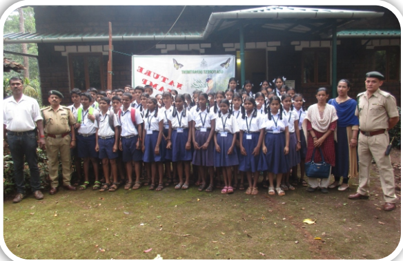
Nature Awareness Camp